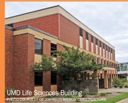
UMD Life Sciences Building