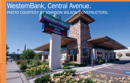
WesternBank, Central Avenue.