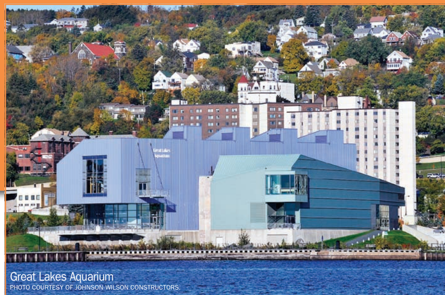
Great Lakes Aquarium

The company specializes in a variety of construction areas, including: