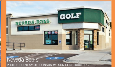
Nevada Bob's