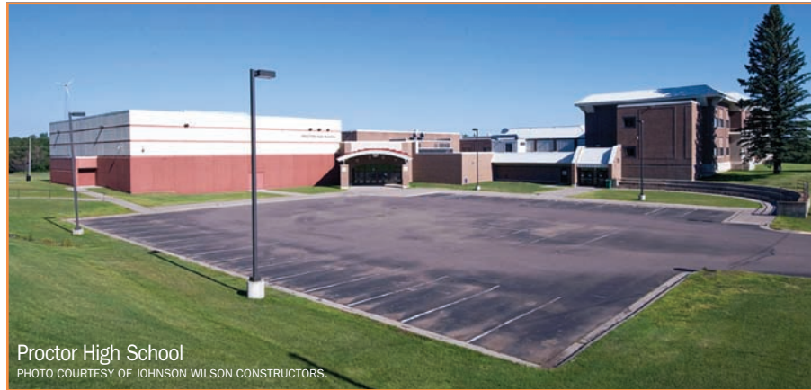
Proctor High School

buildings with the highest level of economic performance.