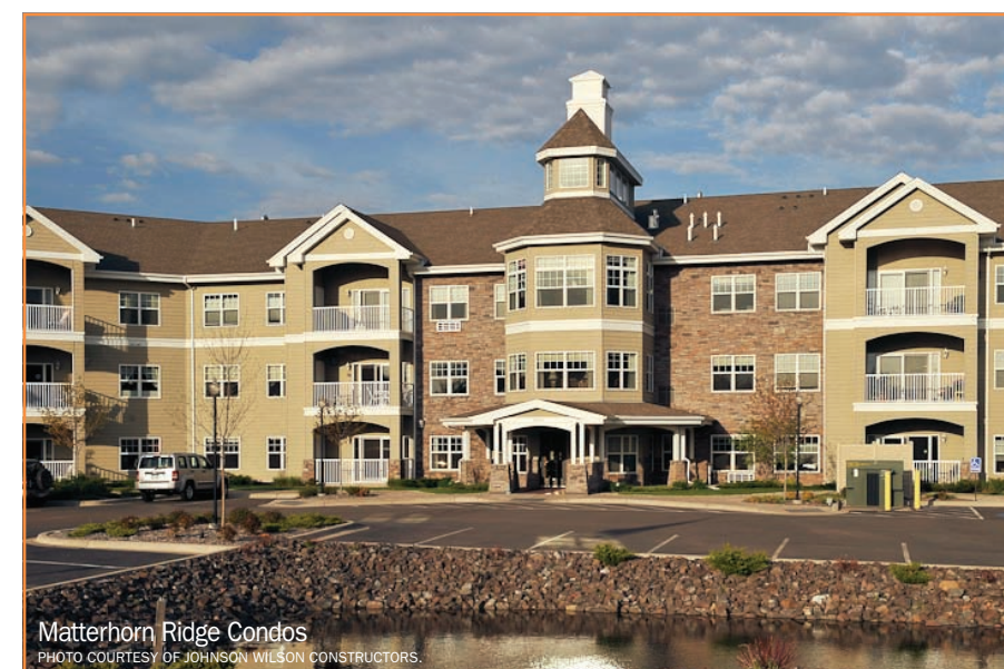
Matterhorn Ridge Condos