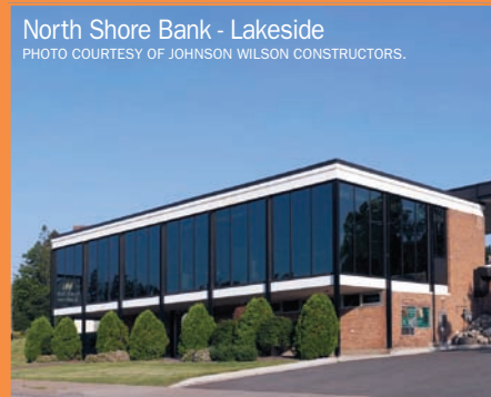
North Shore Bank - Lakeside

foundation and building the facility all the way through the final landscaping. You can hold one company accountable for all of the work done on your project: Johnson Wilson.”