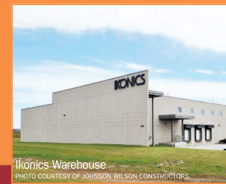
Ikonics Warehouse

During the past 100 years, Butler® Manufacturing has become a worldwide leader in building systems design and construction. Because the structural systems,