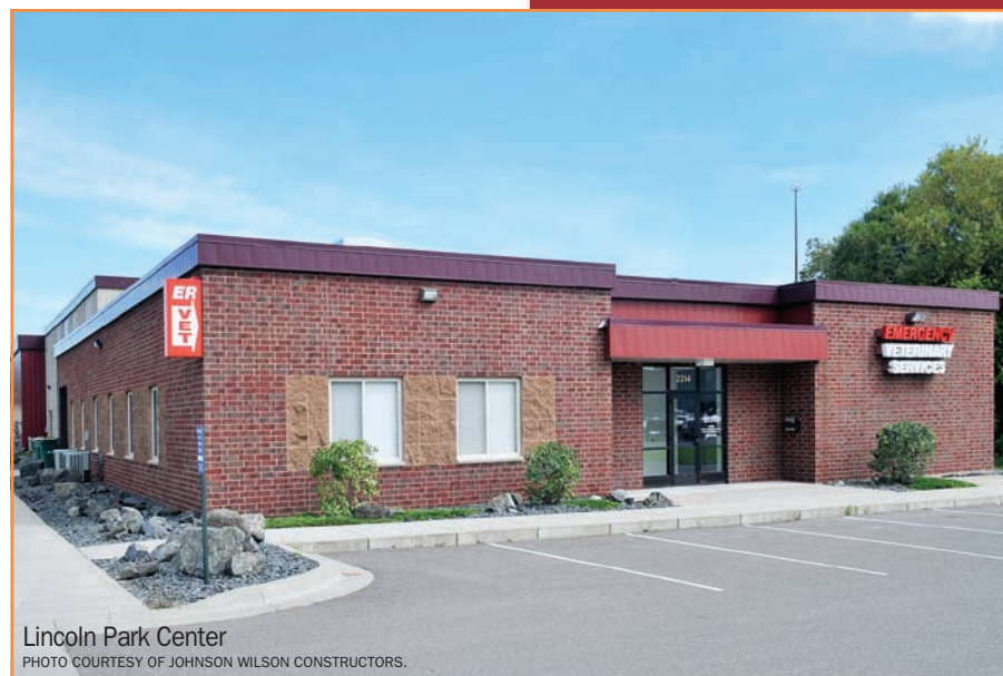
Lincoln Park Center