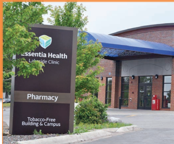
Left: Acme Tools. Above: Essentia Health - Lakeside Clinic.