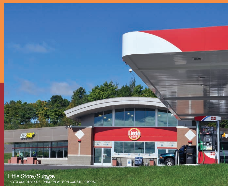
Little Store/Subway